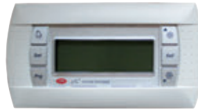
CAREL CHILLER CONTROL