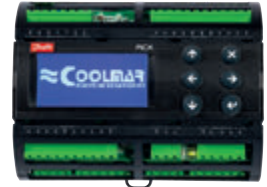
DANFOSS CHILLER CONTROL